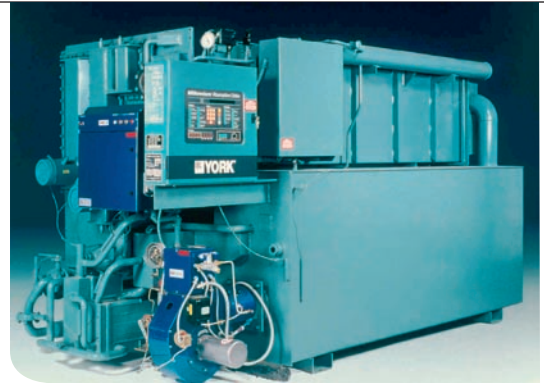
The YORK model YPC absorption chiller/heater, as installed at Cardinal Health, can produce chilled water for cooling and hot water for heating.

In some process operations it is necessary to have a stored quantity of chilled water for periodic high volume uses. This