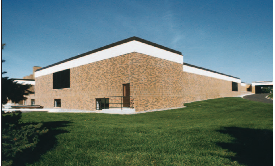
Unity Hospital, Fridley