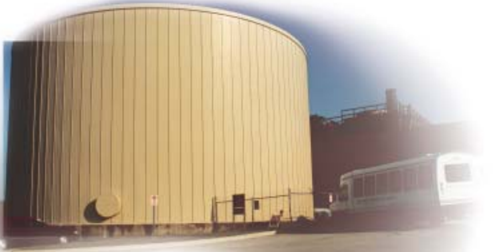
One-million-gallon chilled water storage tank.

"With the chilled water in storage, we can hold down both our demand and our energy charges. It's a good system," Baran states. He indicates that the storage tank is large enough that the 38°F (3°C) chilled water remains stratified from the return