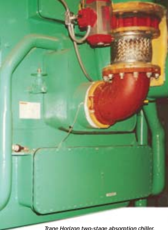
Trane Horizon two-stage absorption chiller.

The boilers have a dual fuel configuration, operable on either natural gas or fuel oil.