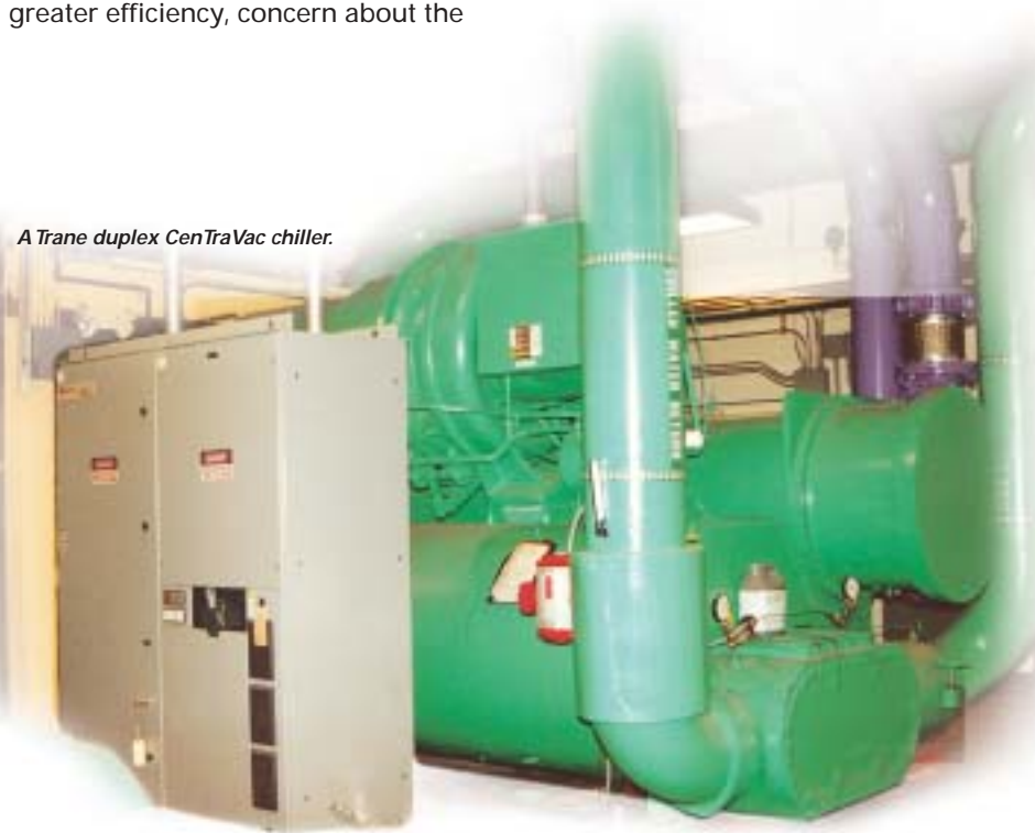
A Trane duplex CenTraVac chiller.

The three new chillers are all connected in parallel and can be operated in any combination, serving cooling load directly or delivering chilled water to the 1.2-million-gallon chilled water storage tank. Cooling