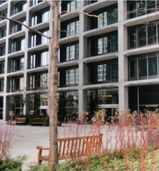
Units were lowered through an opening cut in the plaza deck, above the basement.

“The idea to go with a hybrid plant was clearly a winner ...”