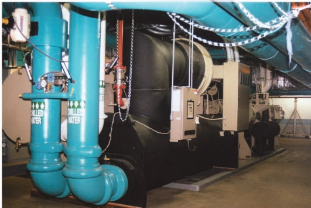
Trane CenTraVac centrifugal chiller.