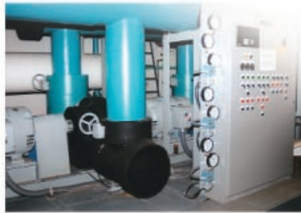
Packaged pump system features variable speed chilled water and condensate pumps.