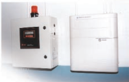
Top: Trane single-stage absorption chiller. Above: Plant is controlled and units prioritized using the Trane Tracer Summit system.