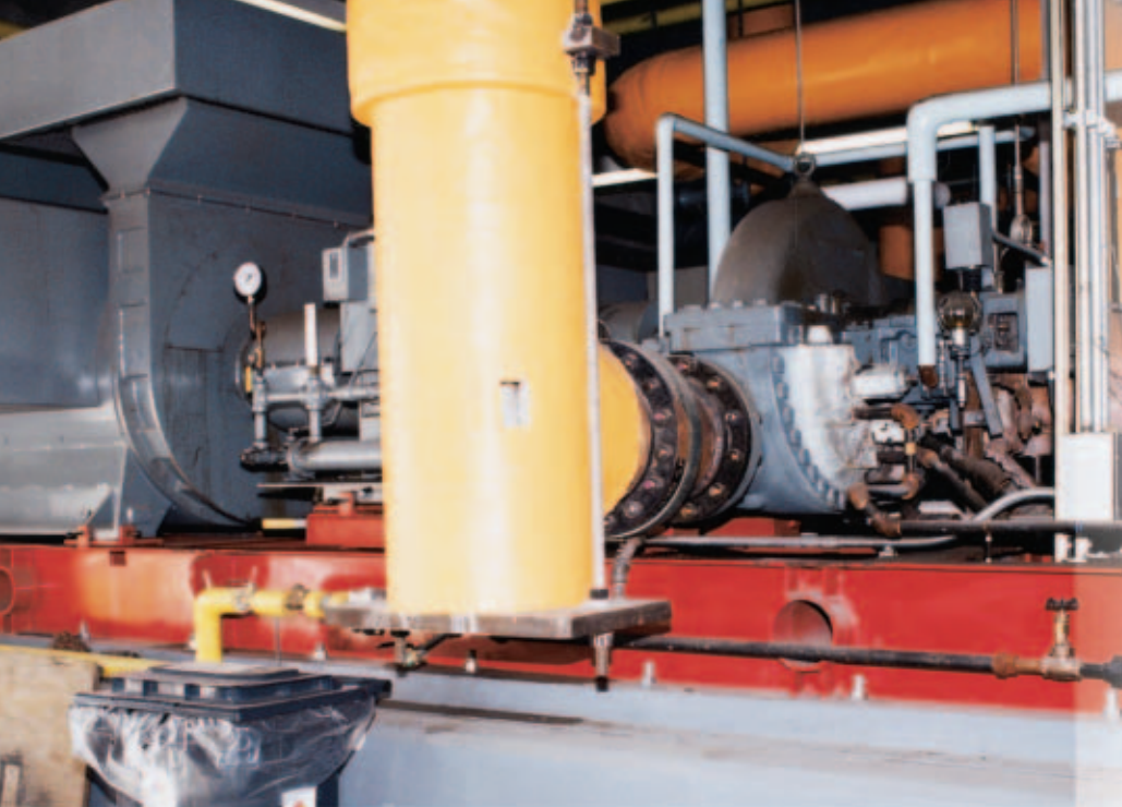
One of the three backpressure turbine-generators.

Casten says that the College system is a very good example of the benefits of backpressure turbine-generators. "The College has demonstrated that sub-megawatt sizes of backpressure turbine-generator sets make economic sense. At Middlebury College we have seen a payback for the systems of less than two years. There are many other institutions out there that have discovered that they can do the same thing."