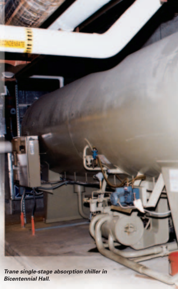
Trane single-stage absorption chiller in Bicentennial Hall.

All of the major building cooling on campus is done by Trane absorption equipment. Because of the availability of surplus steam in the warm months, the College in 1976 installed its first Trane single-stage absorption chiller,