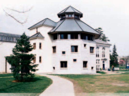
New facilities require more electric energy and more chilled water service.

Middlebury College is growing, and plans are being made to extend steam lines and chilled water service to new campus buildings, including a dormitory and dining hall. Moser notes that with the greater level of steam use for new campus building, on-campus electric generation will increase proportionately. Just as Middlebury College has pioneered new ideas in education, with absorption cooling and turbine-generators it is also showing the way for many other energy users.