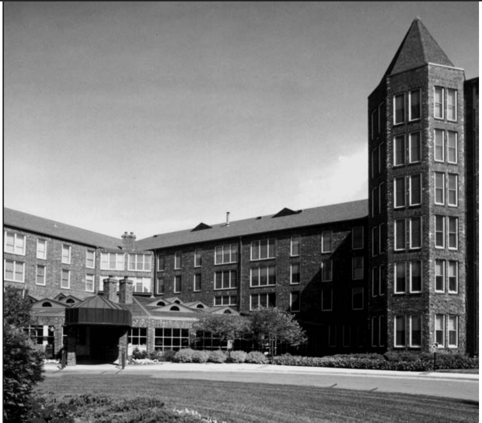
Natural gas central humidifier, 300,000 BTU with four burners; 120-unit wing of Becketwood high-rise in Minneapolis.

Residents of the east wing of Becketwood high-rise in Minneapolis were among the first to sing the praises of a natural gas-fired humidification system installed in their building in January 1996. DRISTEEM Humidifier of Eden Prairie developed and provided the unit and CenterPoint Energy Minnegasco covered costs to install it.