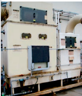
Installed Kathabar desiccant dehumidification unit

When used in conjunction with conventional air conditioning units, targeted temperature and humidity levels are attained more quickly, and require a significantly lower amount of electricity without over-cooling or chilling the air. DryKor systems can be used to substitute desiccant dehumidification to reduce air conditioning requirements in warm and humid climates. These systems are also used in cool and humid climates where mechanical refrigeration is typically used only for dehumidification. Over 1,000 DryKor systems have been installed worldwide.